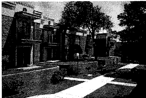
Isola Bella Apts. removed all the dated mansard roofs during renovations

When the opportunity arose to acquire the old Woodlake Apartments in Oklahoma City, Accord took action. Looking for stability and growth in any new venture, they felt Oklahoma City offered a stable employment base and with new businesses arriving, it seemed like a viable location. With the Procure Proton Therapy Center, the FAA Training Academy and more located nearby, the property has no shortage of people looking for extended accommodations.